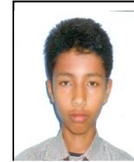
UNIV BORUAH CGPA 9.6 AISSE 2016